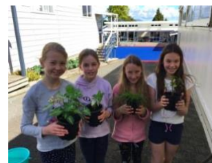
After the plants were repotted in bigger pots.

Try to be a plant saver like us and save your plants. And make sure to wear gloves.