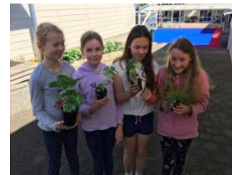
Before we repotted the plants.

First we got some seasol (seaweed plant tonic) and put it in a bucket with some water. Then we used a knife to get them out of their pots. After that, we left them in the bucket while we filled their new pots with potting mix. Finally, we put them in their brand new pots.