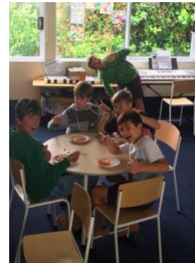
The boys needed several helpings to see if baked beans were better!!!